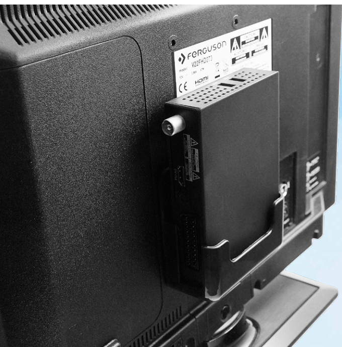
receiver holder sold separately