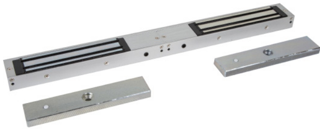
ML600-D / ML600-D-M