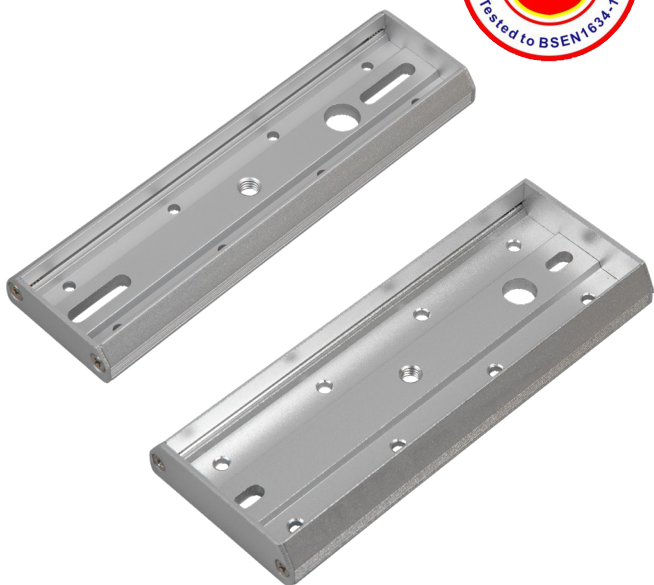
AH600 / AH1200