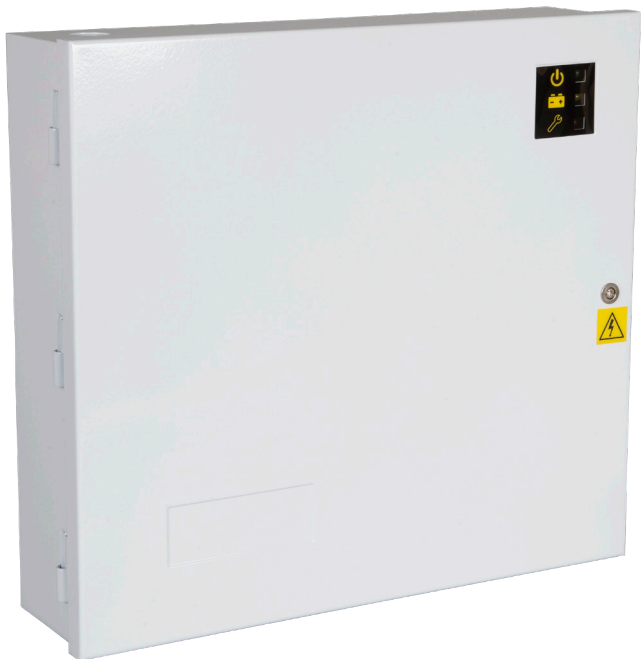
24V POWER SUPPLY

Market leading Power Supplies just got better, now with replaceable modular boards. Allowing you to upgrade your products both quickly and easily