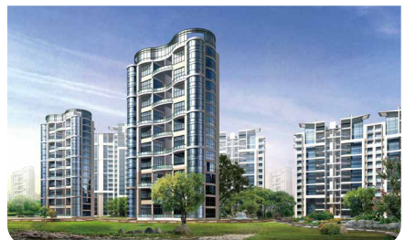
Smart Building Management Systems