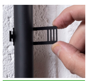
Simply wrap around the cable