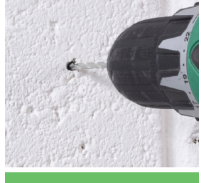
Drill a 5mm pilot hole