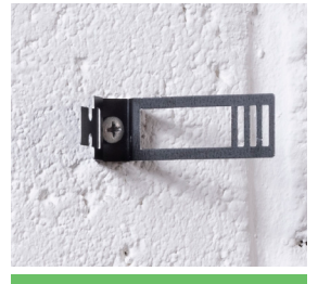
Secure screw-fix, no wall plug required