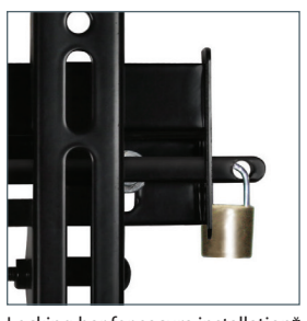
Locking bar for secure installation*