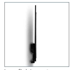
Low profile design mounts screen only 44mm (1.7") from wall