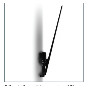
5 fixed tilt positions up to +15°