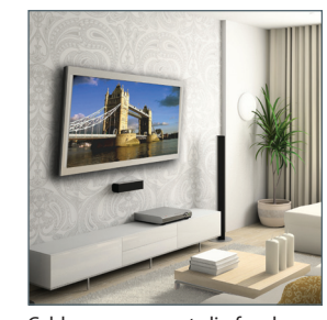
Cable management clip for clean and tidy installation

Padlock not included* SS-BTV521-V3-091115 Page 1 of 2