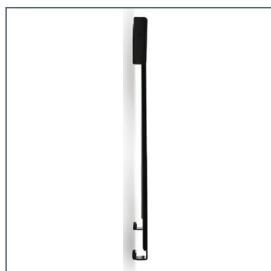
Low profile design mounts screen only 20mm (0.8") from wall