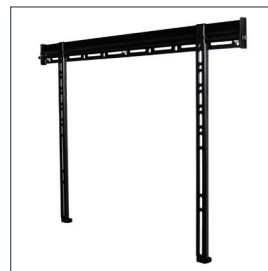
Available in Black