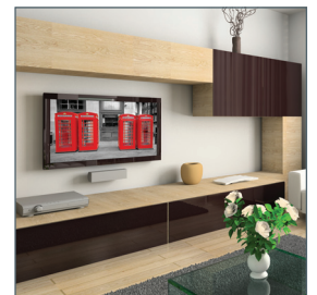
Easy to install in any home