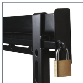
Locking bar for secure installation*