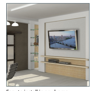
Easy to install in any home

*Padlock not included SS-BTV511-V2-091115 Page 1 of 2