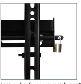
Locking bar for secure installation*