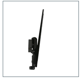
5 fixed tilt positions up to +15°