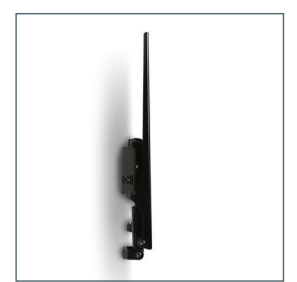
Low profile design mounts screens only 44mm (0.8") from the wall